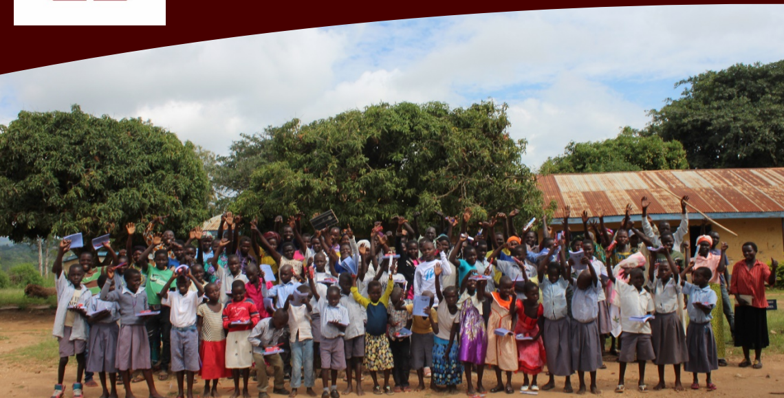
Above – Our 37 children from Jupangira Primary School under the “Educate A Child” sponsorship program pose for a picture in front of the school after receiving their termly scholastic materials on May 26 th , 2018.