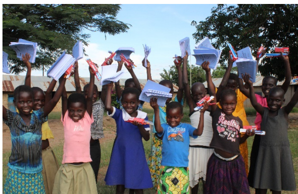
Above - are some of the new beautiful faces we have added. These are the 13 girls recruited from Pawong Primary School.

We are very grateful to God for the far He has brought us. This year we have witnessed a lot of favor in this ministry and we deeply know that it is God affirming this vision as His.