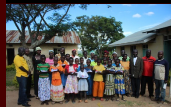
Above – The 20 new girls recruited from Goli Mixed Primary School