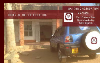
Above – The front view of our new office in Nebbi Town.