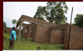
Above – The Completed wall of our office block awaiting roofing and finishing.